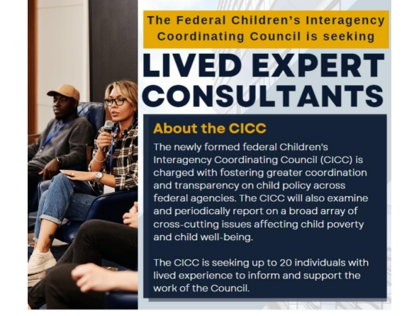
Calling those with lived experience!

The federal Children's Interagency Coordinating Council (CICC) is looking for individuals with lived experience to help inform their work. As a Lived Expert Consultant, you'll contribute to strategies, attend cool events, and even write for the quarterly newsletter!